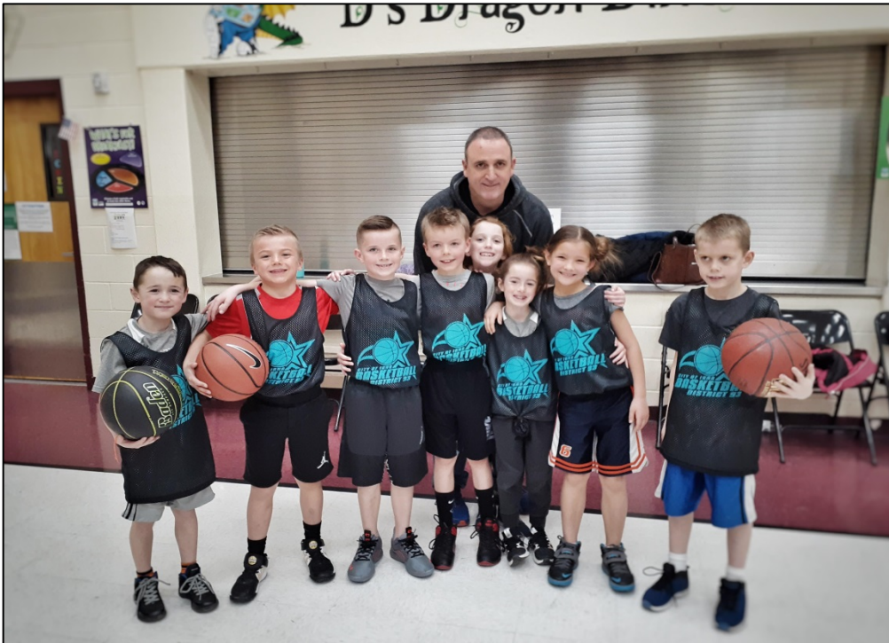
"SMALL TOWN WITH A BIG HEART"